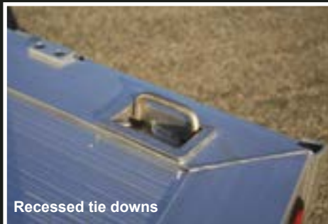
Recessed tie downs