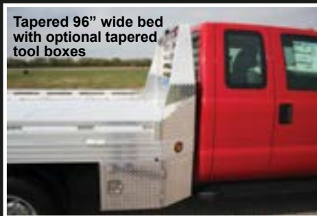
Tapered 96" wide bed with optional tapered tool boxes