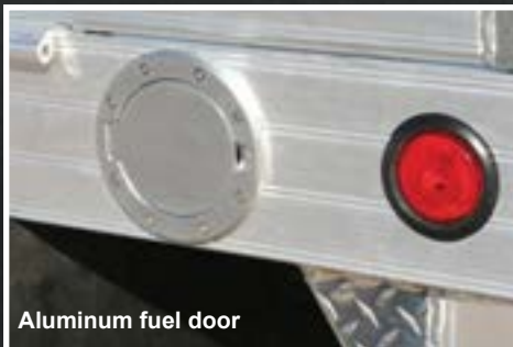
Aluminum fuel door