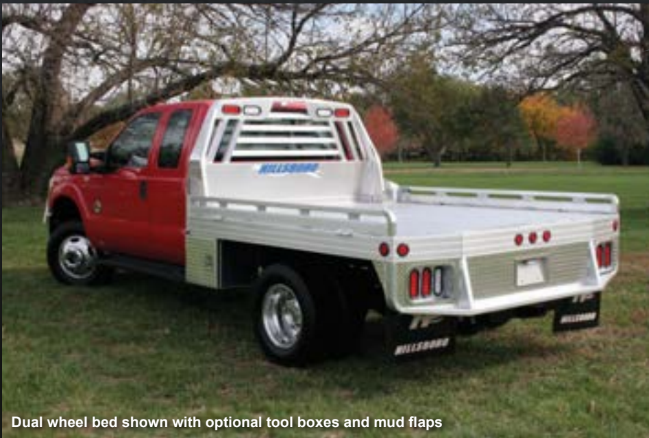
Dual wheel bed shown with optional tool boxes and mud flaps