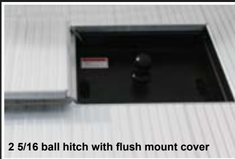
2 5/16 ball hitch with flush mount cover