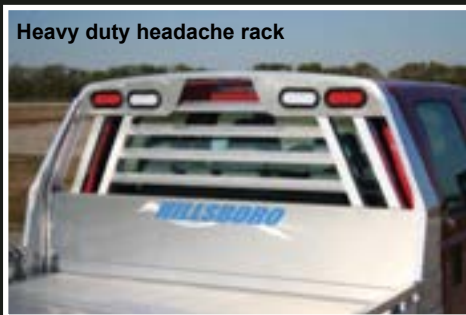
Heavy duty headache rack