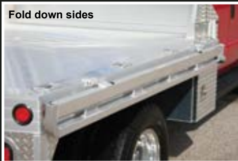
Fold down sides