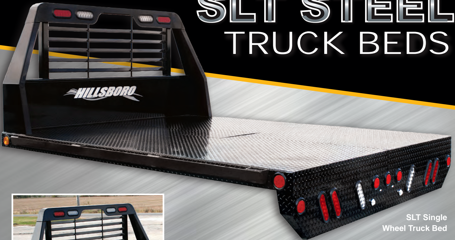
SLT Single Wheel Truck Bed