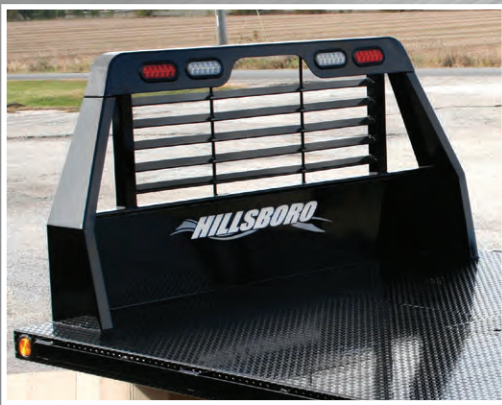
SLT Dual Wheel Truck Bed